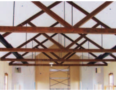
Work continues on the soon-to-be-remodeled sanctuary at Crown Hill Mennonite church in Rittman, Ohio.

A s a full service, design-build construction company that self performs many of the tasks necessary to complete our projects, we tend to run into some interesting jobs, as well as a wide variety of construction designs and details. Our current book of work is no exception. Not only are we fortunate to have a heavy workload, but also several interesting projects under construction. We currently have three projects in our