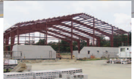
At Orrville High School's new multipurpose facility, the pre-engineered metal building has been erected and masonry work has started.

With more than 81 years of history, the Mansfield Renaissance Theater has seen many uses through the years. Currently, the theater presents different Broadway and comedy acts, as well as hosting the