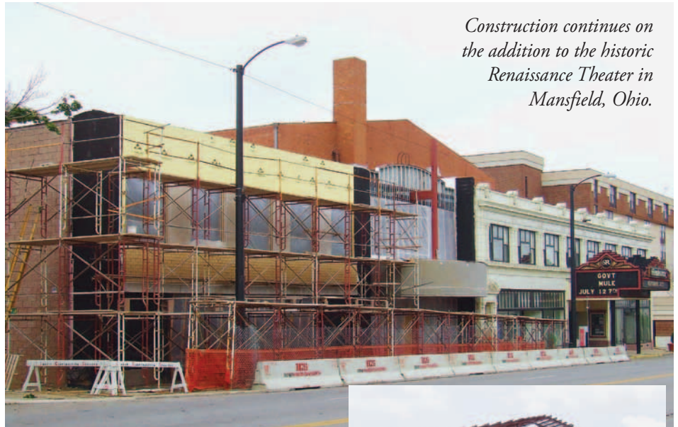
Construction continues on the addition to the historic Renaissance Theater in Mansfield, Ohio.

TEL 330-683-4498 • FAX 330-683-1952 www.imhoffinc.com