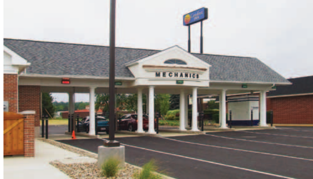
The new Mechanics Bank features a six-lane drive-thru.

The new location on Trimble Road is a 2,500-square-foot facility with an 1,800-square-foot, six-lane drive-thru. A wood frame building with brick and stone veneer, it includes pre-engineered wood trusses and asphalt shingles. Among the bank's standout design features are a cupola at the center of the building, which acts as a skylight to the circular lobby located directly